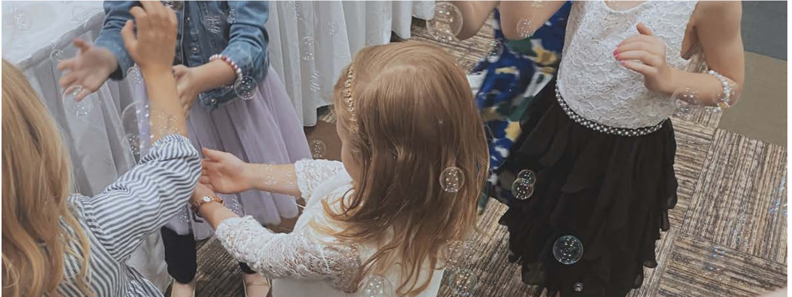
2021 DADDY DAUGHTER DANCE

Prevention efforts occur first and foremost through prayer. Prayer is an effective way to defeat exploitation, a modern-day slavery. Action169 hosts prayer calls and mobilizes national and international prayer initiatives to eradicate a spiritually-oppressive injustice. While prayer and awareness are essential, it is not enough without taking social action.