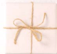
Strip Club Outreach | *Name Changed