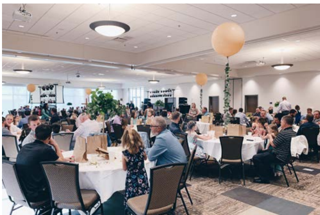
2019 DADDY DAUGHTER DANCE

Effective actions of prevention include the billboard campaign, printed and published material that is reaching concerned citizens, advocates, counselors, and volunteers of various anti-exploitation organizations. Actions of prevention also include trainings on decreasing demand, awareness events such as the annual Freedom Race 5k 10k and the Daddy Daughter Dance—designed to strengthen the family and decrease vulnerabilities in youth.