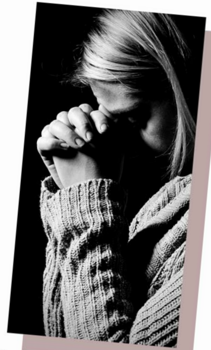
Letter from a precious woman we met while ministering in a rehab facility | *Name Changed