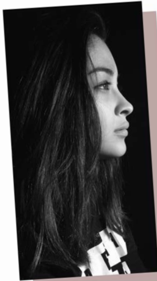
Overcomer of exploitation who participated in a restoration group | *Name Changed