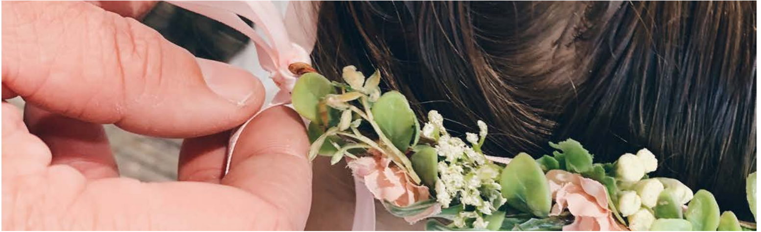
2019 DADDY DAUGHTER DANCE

Prevention efforts occur first and foremost through prayer. Prayer is a powerful and effective way to defeat exploitation, a modern-day slavery. Action169 hosts prayer calls and mobilizes national and international prayer initiatives to eradicate a spiritually oppressive injustice.