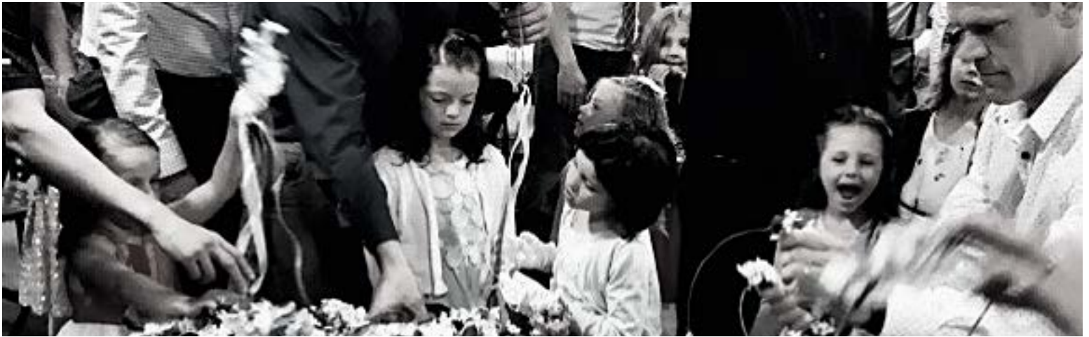
Flower Crowns for the Daughters, 2018 Daddy Daughter Dance

Prevention efforts occur first and foremost through prayer. Prayer is the most powerful and effective weapon to combat exploitation, a modern day slavery. Action169 hosts prayer calls and mobilizes national and international prayer initiatives to eradicate a spiritually oppressive injustice.